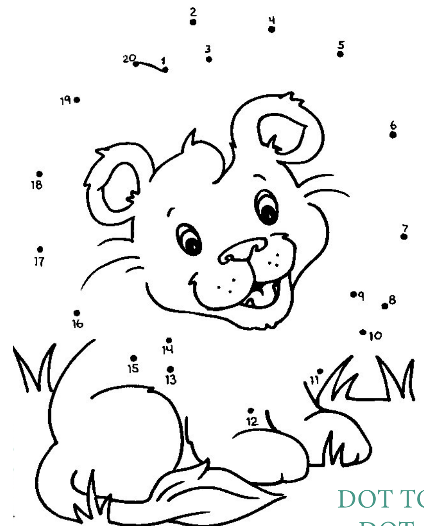
DOT TO DOT