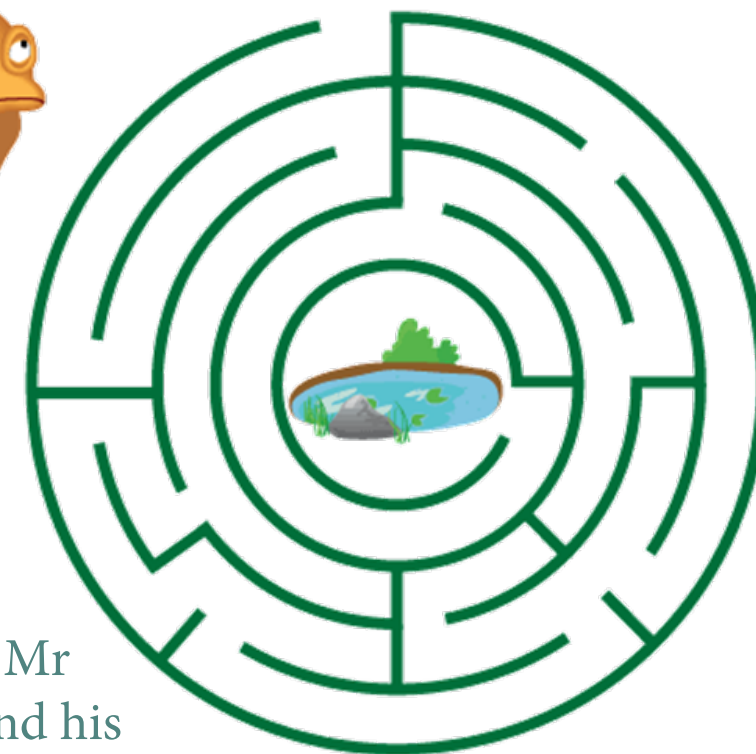
Help Mr Fishy find his way home